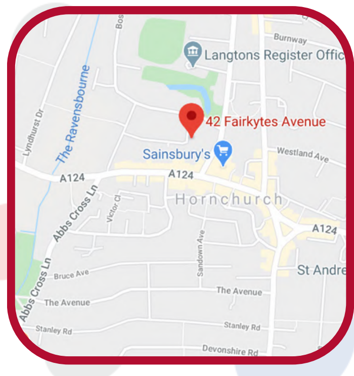
42 Fairkytes Avenue

To make a referral, for further enquiries and for more information: